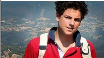
St Carlo Acutis,

Carlo Acutis, witness of holiness in simplicity Speaking about