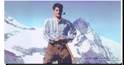
St Pier Giorgio Frassati

Pier Giorgio Frassati, beacon for lay spirituality Describing the life of Saint Pier Giorgio Frassati, a young Italian man of the early 20th century, his participation in Catholic associations and service to the poor, the Pope said that also today "Pier Giorgio's life is a beacon for lay spirituality," since faith was not a private matter and could be lived in community in with membership in ecclesial associations and through generous commitment to political life and service to the poor.