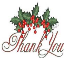
Plate €300, Renovation Fund Envelopes €990, Offerings €980 . We received a gift this week of €500 for the Renovation Fund. Thanks to all who contribute in whatever way to the parish, your generosity is appreciated. If you wish you can leave your envelopes and contributions in the collection tables in the Church or in the Parochial House.

CHARITY SHOP Thank you for your great support to the shop throughout the year. It is greatly appreciated. It will remain closed until further notice. Thanks to all the ladies in the shop for their wonderful work and commitment.