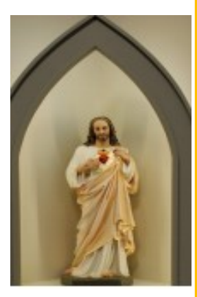
Make love your aim 1 Cor 14:1

There is a video available on the parish website which will help with Lectio Divina. www.kilbegganparish.ie