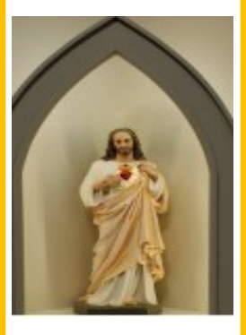
Make love your aim 1 Cor 14:1

Come to me, all you that are weary and are carrying heavy burdens, and I will give you rest. Take my yoke upon you, and learn from me; for I am gentle and humble in heart, and you will find rest for your souls. For my yoke is easy, and my burden is light." Mt.11: 28-30