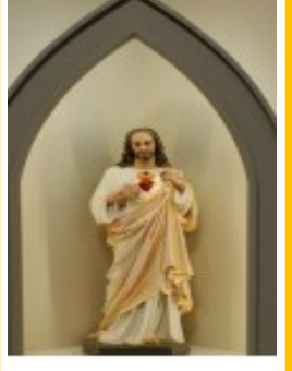
Make love your aim 1 Cor 14:1