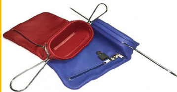
Plate: €930, Church Renovation: €1,660, Offerings €1,330 We will resume collections at Mass with a collection Bag being passed around.