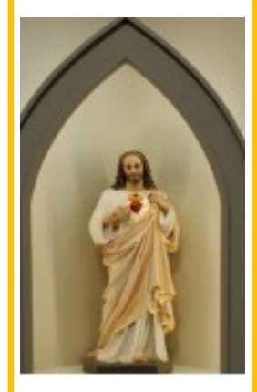
Make love your aim 1 Cor 14:1

Come to me, all you that are weary and are carrying heavy burdens, and I will give you rest. Take my yoke upon you, and learn from me; for I am gentle and humble in heart, and you will find rest for your souls. For my yoke is easy, and my burden is light." Mt.11: 28-30