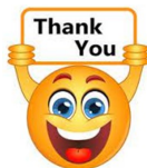
Plate: €1,122; Offerings: € 340; Renovation Fund: €1,785. Thanks to all who are so generous.

Parish Charity Shop Open Tuesday to Saturday 10 a.m. - 5 p.m. New Summer stock on sale. We ask people not to leave bags at the door. We can only accept and sell quality items. If you think it is rubbish, it most likely is.