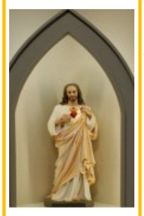
Make love your aim 1 Cor 14:1

Come to me, all you that are weary and are carrying heavy burdens, and I will give you rest. Take my yoke upon you, and learn from me; for I am gentle and humble in will find rest for your souls. For my yoke is easy, and my burden is light." Mt.11: 28-30