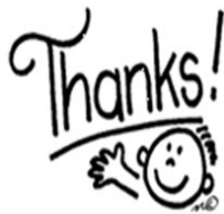
Plate: €995; Renovation Fund: €1,561; Offerings and List of the Dead €735. Thanks to all who are so generous .

Charity Shop will be open on 4 Mondays before Christmas. Massive reductions on ladies and gents clothing before Christmas. Good selection of Christmas stock in shop. Plenty of opportunity to get gifts. Open Monday to Saturday 10 a.m. - 5 p.m