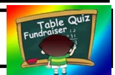
Table of 4 = €40.00 Raffle on the night. Thank you for your support.

RAHUGH SCHOOL TABLE QUIZ, The Hazel Rahugh, Thurs. 9 th Nov 2023 @ 8pm sharp.