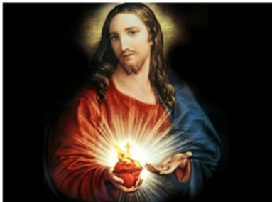
On the Human and Divine Love of the Heart of Jesus Christ

In a world where everything is bought and sold, people's sense of their worth appears increasingly to depend on what they can accumulate with the power of money. We are constantly being pushed to keep buying, consuming and distracting ourselves, held captive to a demeaning system that prevents us from looking beyond our immediate and petty needs. The love of Christ has no place in this perverse mechanism, yet only that love can set us free from a mad pursuit that no longer has room for a gratuitous love. Christ's love can give a heart to our world and revive love wherever we think that the ability to love has been definitively lost.