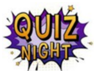
Table Quiz in The Hazel, Rahugh on Thursday 5th February at 8pm sharp in aid of Rahugh School. Tables of 4 at €40 per table. Raffle with great prizes on the night. Please support.